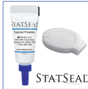
STATSEAL Powders & Discs