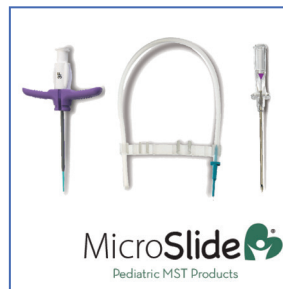
Galt Neonatal MicroSlide Introducers (In Select Territories)