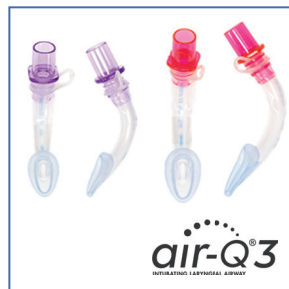
Air-Q3 Intubating Laryngeal Airway