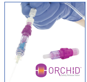
Orchid SRV (Safety Release Valve)

Speak with Your HCT Representative On Programs and Availability