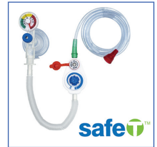
AirLife SafeT™ T-Piece Infant Resuscitator