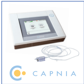
CoSense Monitor & Precision Sampling Set

HCT provides clinically differentiated technologies and competitive pricing that meet the needs of neonatal clinicians.