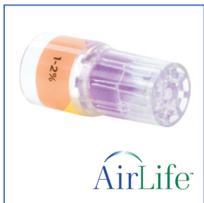
MaxCap™ Colorimetric CO2 Indicator